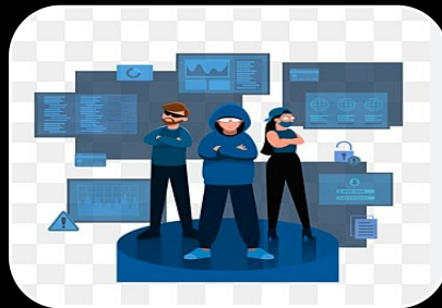
Create a culture of cybersecurity - involve everyone and designate security ambassadors