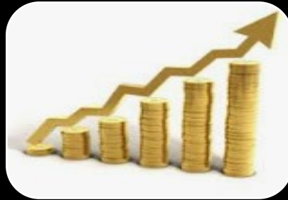
Increase the cybersecurity budget