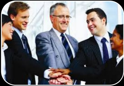
Get support from top management