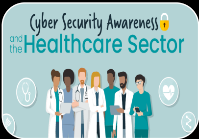
Enforce cybersecurity education and training (IT staff and all employees)