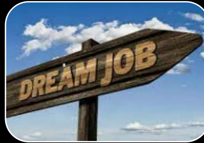
Create more cybersecurity positions (intern & extern) and offer competitive salaries and benefits