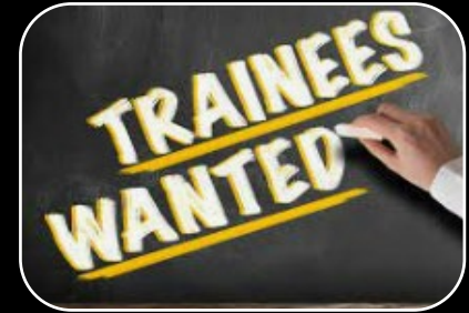
Work with cybersecurity schools (trainees)