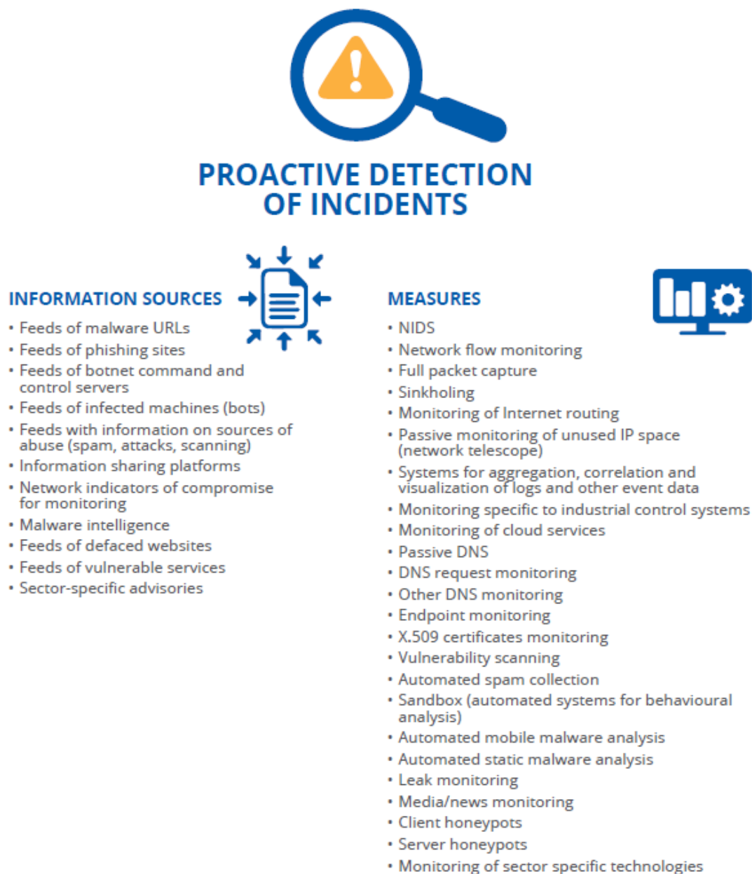
Figure 1: Information sources and measures covered by the study