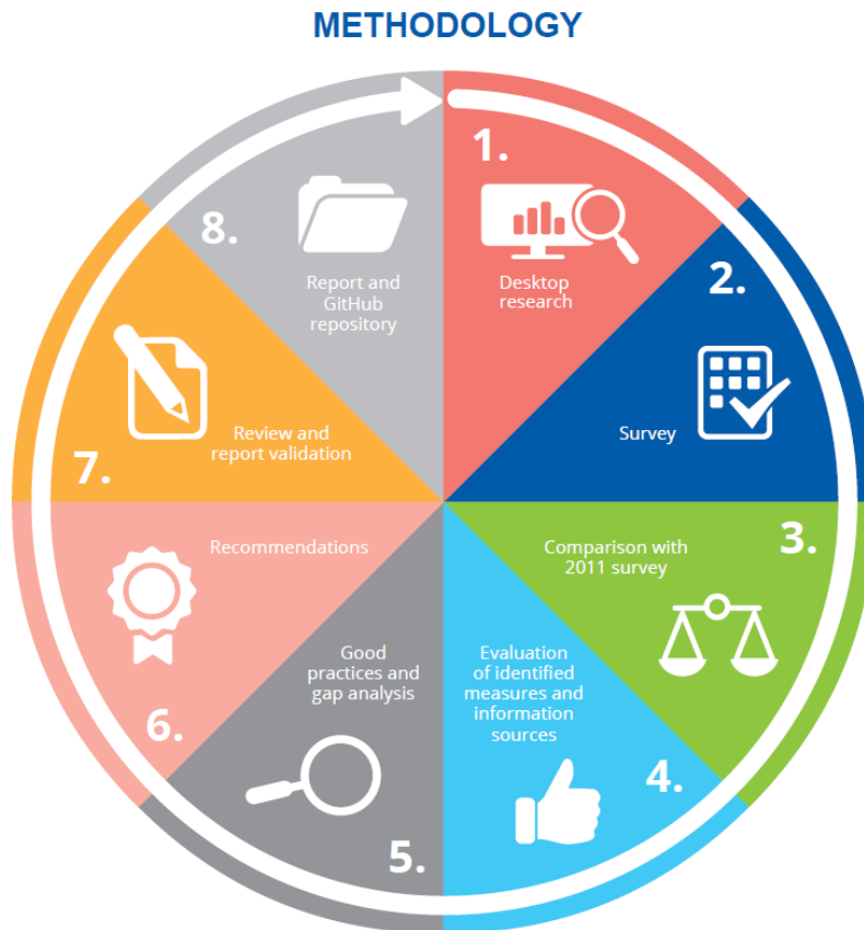
Figure 2: Methodology

This section describes the methodology used in different parts of the analysis.