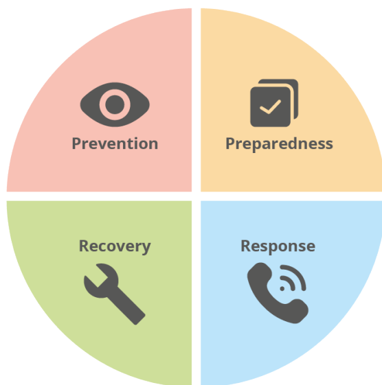
Figure 3: Cyber crisis management lifecycle

The management of cyber crises can be broken down into different phases. The Blueprint (2017) breaks down the crisis management lifecycle into four phases: prevention, preparedness, response and recovery (89) .